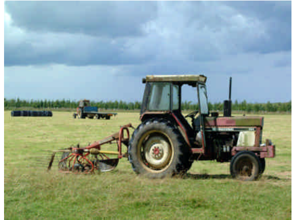
Barley Farmers at risk